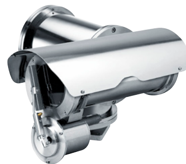
NXPTH + NXMK + VIPNX